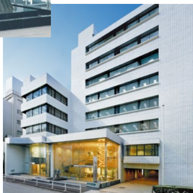
Mochida’s Head Office in Tokyo

This sculpture is “Plaisir” (Joy), a work created by the well-known Japanese artist Taro Okamoto (1911–1996) for the Company’s 65th anniversary in 1978. “Plaisir” was named after our wish to be tied to people with joy, and our joy in contributing to human health and welfare, as a comprehensive healthcare company.