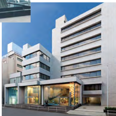
Mochida’s Head Office in Tokyo

This sculpture is “Plaisir” (Joy), a work created by the well-known Japanese artist Taro Okamoto (1911–1996) for the Company’s 65th anniversary in 1978. “Plaisir” was named after our wish to be tied to people with joy, and our joy in contributing to human health and welfare, as a comprehensive healthcare company.